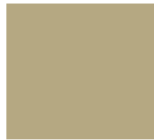
0288 Autumn Beige