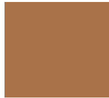
5238 Sunbaked Clay