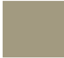
6063 Winter Beige