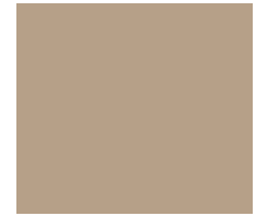
5234 Summer Beige