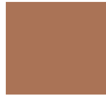
C-22 Coral Red